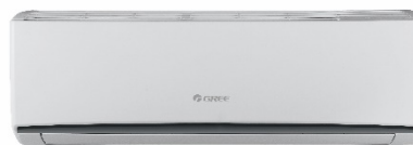
2.5-7.0kW dX Split (Indoor Unit)