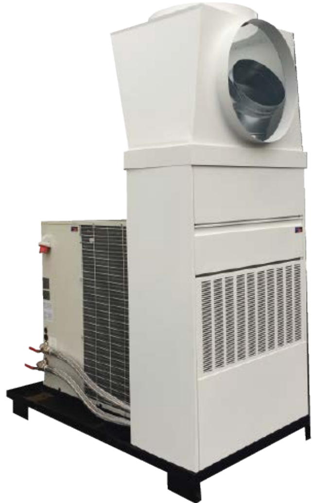
SC.30 Spot Cooler